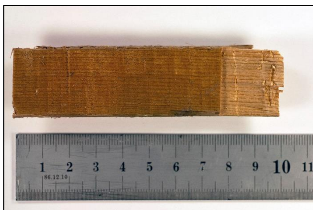
Fig. 3. Sill plate sample. No magnification. MI 2.