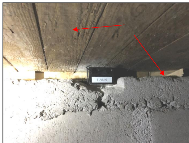
Fig. 2. Sample collection points from the sill plate and the crawl space ceiling in the northern facade. A wireless sensor is installed in the middle.

The samples presented in this paper were gathered from the sill plate and crawl space ceiling in the north facing facade. Fig. 2 show the sample location.