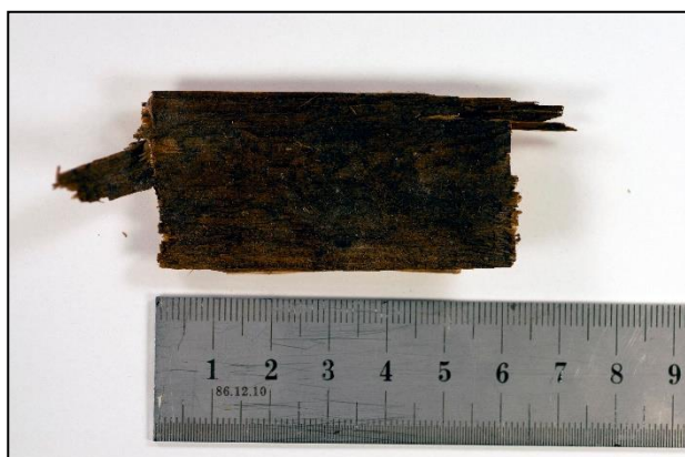
Fig. 5. Crawl space ceiling sample. No magnification. MI3.