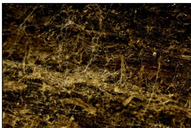
Fig. 6. Crawl space ceiling sample. 40x magnification. MI3.