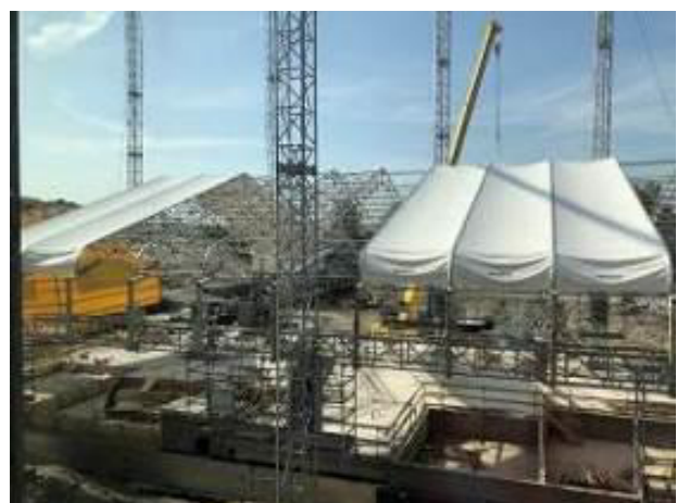
Fig. 3. Jens-Lüder Herms – Tent structure to enclose a multi-storey CLT building

If the building site is completely enclosed, work can proceed regardless of the weather conditions. This leads to optimal working conditions for building technicians. The disadvantages are the high costs and the additional time necessary to erect and then dismantle the enclosure and the associated foundations.