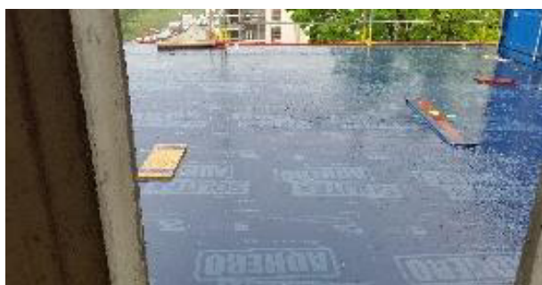
Fig. 5. Jens-Lüder Herms – Sheeting to cover a CLT ceiling elements

Full-surface adhesion means that there are no folds that would present tripping hazards. The fleece structure of the membrane also ensures that persons can safely walk across the building components. As water can no longer run off, it must be drained off in a controlled manner and run-offs must be planned.