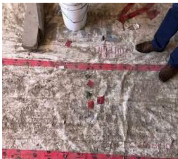
Fig. 4. Jens-Lüder Herms – Sheeting to cover a CLT ceiling elements

In this case, the ceilings are covered with suitable tarpaulins. This approach is relatively inexpensive. The disadvantage of this approach is that seepage can occur behind this sheeting and even small holes may allow water to enter and spread out on the elements. In addition, folds in the sheeting can present an increased accident hazard.