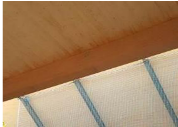
Fig. 2. Roman Szypura – Water stains on a CLT ceiling element.

Once the elements have dried out, ugly stains may remain that are expensive and labour-intensive to rectify