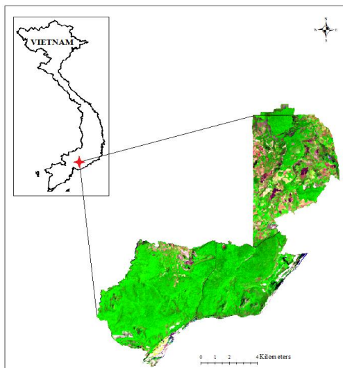
Fig. 1. Binh Chau - Phuoc Buu Nature Reserve location in Southern Vietnam