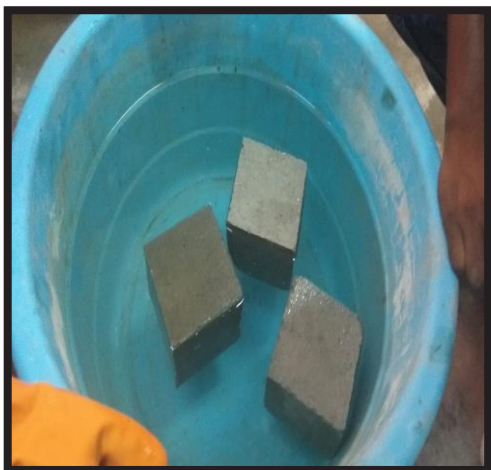
FIG-3 CUBES WHICH ARE FLOATING IN WATER