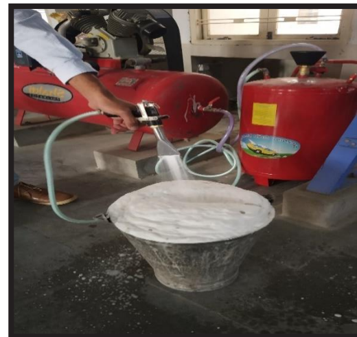
FIG-2 GENERATING FOAM FROM FOAM GENERATOR