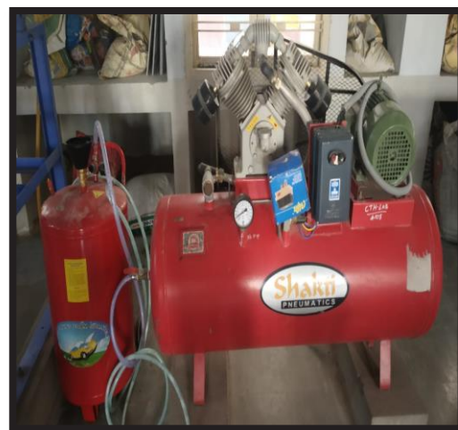
FIG-1 FOAM GENERATOR MACHINE