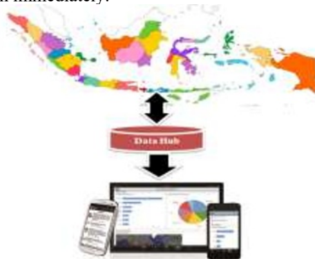
Fig. 1. Energy security dashboard monitoring system concept [7]