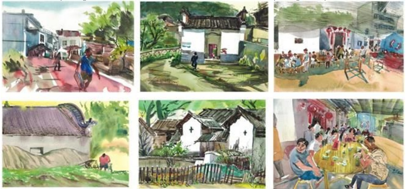
Figure 1. Watercolor works in Hakka folk art classroom

intangible cultural heritage projects such as handmade lantern making skills in Hakka area and Gannan Tea Picking Opera are integrated into the curriculum system. Taking "Hakka cultural experience + quality cultivation + innovative practice" as the training goal, the course orientation is defined, the course content is selected, and the teaching methods are determined, and a scientific teaching evaluation system is established. The picture below shows the course of "Hakka folk art". The teacher guides the students to sketch the watercolor works by filed sketch, explains the life segments of Hakka people, and applies vivid life scene cases to teach students the cultural knowledge of Hakka architecture, Hakka culture and Hakka customs into painting techniques.