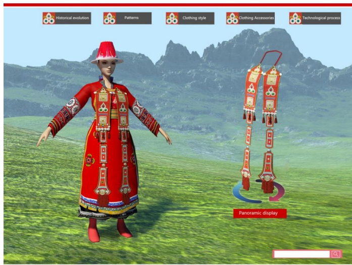
Figure 3: System home interface design