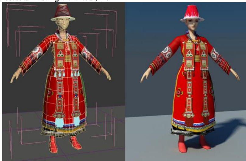
Figure 2: A mock-up of women's clothing in Yugur people

should try to reduce the number of faces and the number of overlapping faces, so as to make the interactive display more smooth.3 Using the technology of model texture mapping and model texture mapping in the plane drawing software to assist the making of all kinds of material texture mapping of the model, and finishing UV correction in 3ds Max, make the material texture match the model type, complete the simulation of the pattern, texture and color of the real fabric. 4 The resulting texture model is baked to produce the final simulation model using VRAY rendering technology. If the model does not reach the evaluation indexes of garment shape, structure detail, fabric color and texture proportion, the related model and texture parameters will be modified until the 360 degree holographic simulation model standard is finally reached. Figure 2.