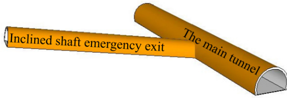
Figure 2. Emergency exit structure diagrams

The evacuation time analysis of emergency rescue stations and emergency exits under different parameters was carried out using Orthogonal Experimental Design methods. Orthogonal Experiment Design is a design method that studies multi-factor and multi-level variables. Orthogonal design experiments are based on orthogonality, and some representative points are selected from the comprehensive experiments for experiments. These representative points have the characteristics of uniform dispersion, neat and comparable 13 . The orthogonal experiment design is mainly divided into the following three steps. First, determine the factors and levels of the trial. Second, build the right orthogonal table; third, design the test plan and list the test results 14 . According to the steps of orthogonal experiment design, it is determined that the number of working conditions established by the emergency evacuation station and emergency exit personnel evacuation model is 24 and 17. The specific working conditions are shown in Tab 3.