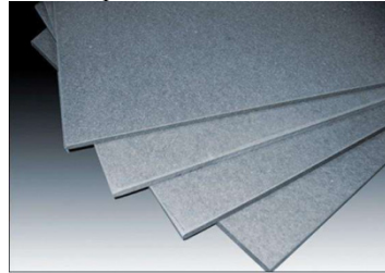
Figure 5: FC board