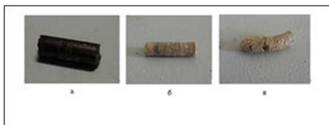
Fig. 1. Fuel Pellet: a) with a burnt surface; b) on-spec fuel pellet; c) defective pellet due to an excessive moisture content of raw material

It should be noted that in the course of granulation in a granulator with a flat rotating die and pressure rollers, the moisture content of the feedstock changes significantly. In the experiment, the granulator was fed with chips having a moisture content of 19.4 %. In the gap between the rollers and the die, a significant amount of heat is released, the pressed chips are heated, and their moisture content decreases. The heating of the pressed material continues as it passes through the die holes. At the die outlet, the pellets have a moisture content of 12.1 % and an elevated temperature. During cooling, the moisture content of pellets decreases to 8.1 %. Thus, in the course of granulation, the moisture content of the material decreases almost 2.4 times from 19.4 to 8.1 % that should be considered when developing an industrial process.