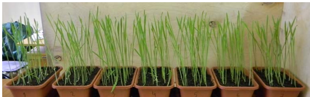
Fig. 3. Seeds germination 7 days after planting

Figure 3 shows wheat germ after 7 days after planting.