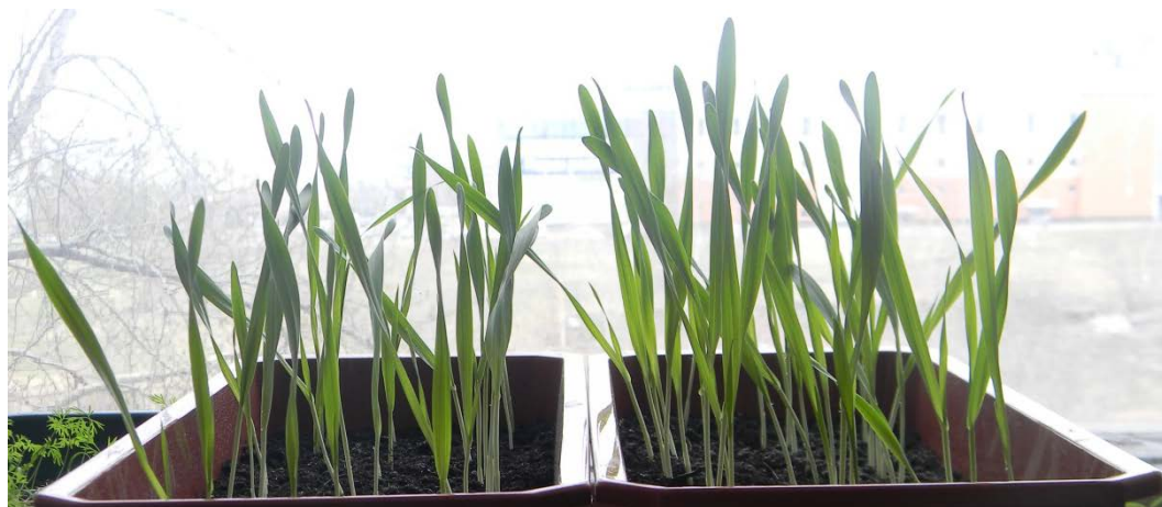
Fig. 2. Seed emergence 7 days.

Figure 2 shows the sprouts of barley after 7 days after planting.