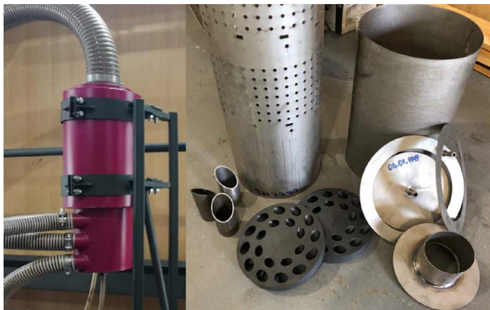
Fig. 2. The first stage of the environmental protection system is a drip collector: on the left is its appearance, on the right are its components and drop-off elements.

The second stage of protection is a granular filter (5) for finer purification of exhaust gases from chrome anhydride vapors and other pollutants. The principle of the filter operation is to pass a stream of contaminated gas through the filter layer of granular materials made of acid-resistant materials, for example, fluoroplastic, of various sizes. The cleaning efficiency increases with decreasing grain diameter in the layer and increasing layer resistance. The gas flow is supposed to be directed through packets of granular materials of various sizes, starting with particles of larger diameter and ending with the smallest (6 chambers with different particle diameters). In a granular filter, aerosol capture occurs due to adhesion (adherence) of vapor and liquid droplets to the grains of the material, their condensation and subsequent enlargement. It is possible in the filter to repeatedly rotate the steam stream by 90^\circ to improve cleaning due to inertial separation of heterogeneous systems. To prevent the entrainment of the grains of the filtering material with a gas stream, the bags are covered with a mesh made of an acid-resistant material with a hole diameter of a smaller diameter than that of the grains.