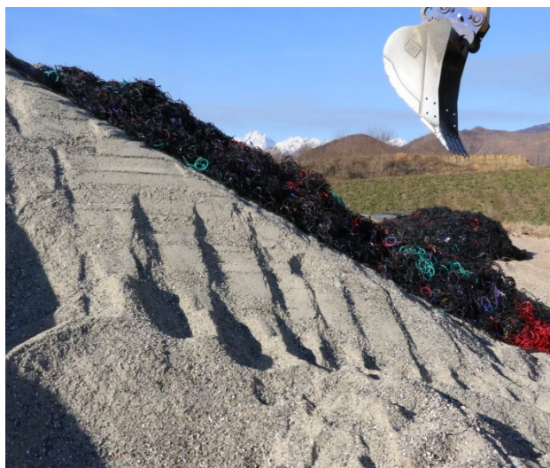
Fig. 2. Two types of non-conventional materials: the slope in the foreground is made of different fragmented and sieved glass; the bench in the background is made of polymeric cuttings from gasket production.