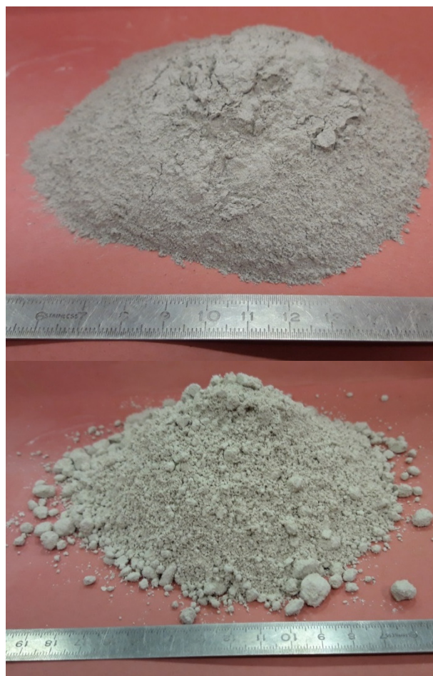
Fig. 5. Fine powder from quarrying/mining activities currently not recycled. (Top) from dry comminution process of olivine minerals. (Bottom) from wet comminution of quartz minerals.

Sampling and specimen preparation have also a significant influence, as sometimes these materials are used in thin layers and this needs to be taken into account when assessing the investigated properties at laboratory level. Moreover, shape of fragments can