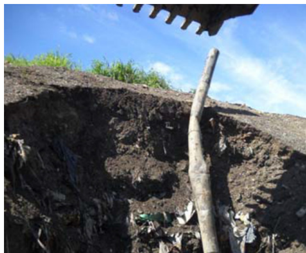
Fig. 4. Temporary covering of non hazardous waste dump with engineered material arising from mixed soils, glass, debris from clean water sedimentation (credits Oggeri 2014).