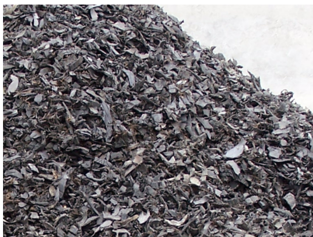
Fig. 3. Shredded exhausted tires (image at 1m scale).