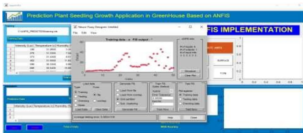
Fig. 2. Application of ANFIS Setting Neuro Fuzzy

Total training data that is used for learning needs is 50 data and then the data will be processed with the prediction system with adaptive neuro fuzzy inference system (ANFIS) algorithm. At the system with 6 input and 1 output after the training data, load the data and choose the grid partition to generate fis with epoch is 9 and tolerance of error is 0.00005 and it will generate 7 epoch for 0.00041481 that is already qualified and the data will be tested to generate average testing error value for about 0.00041316. The training data that is already added into the system will be proceed by predicting system ANFIS and can be shown on figure 2.