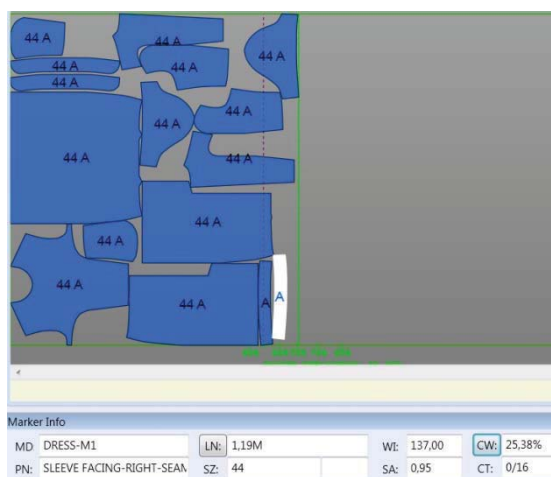
Fig. 3. Marker for robotic cutting.