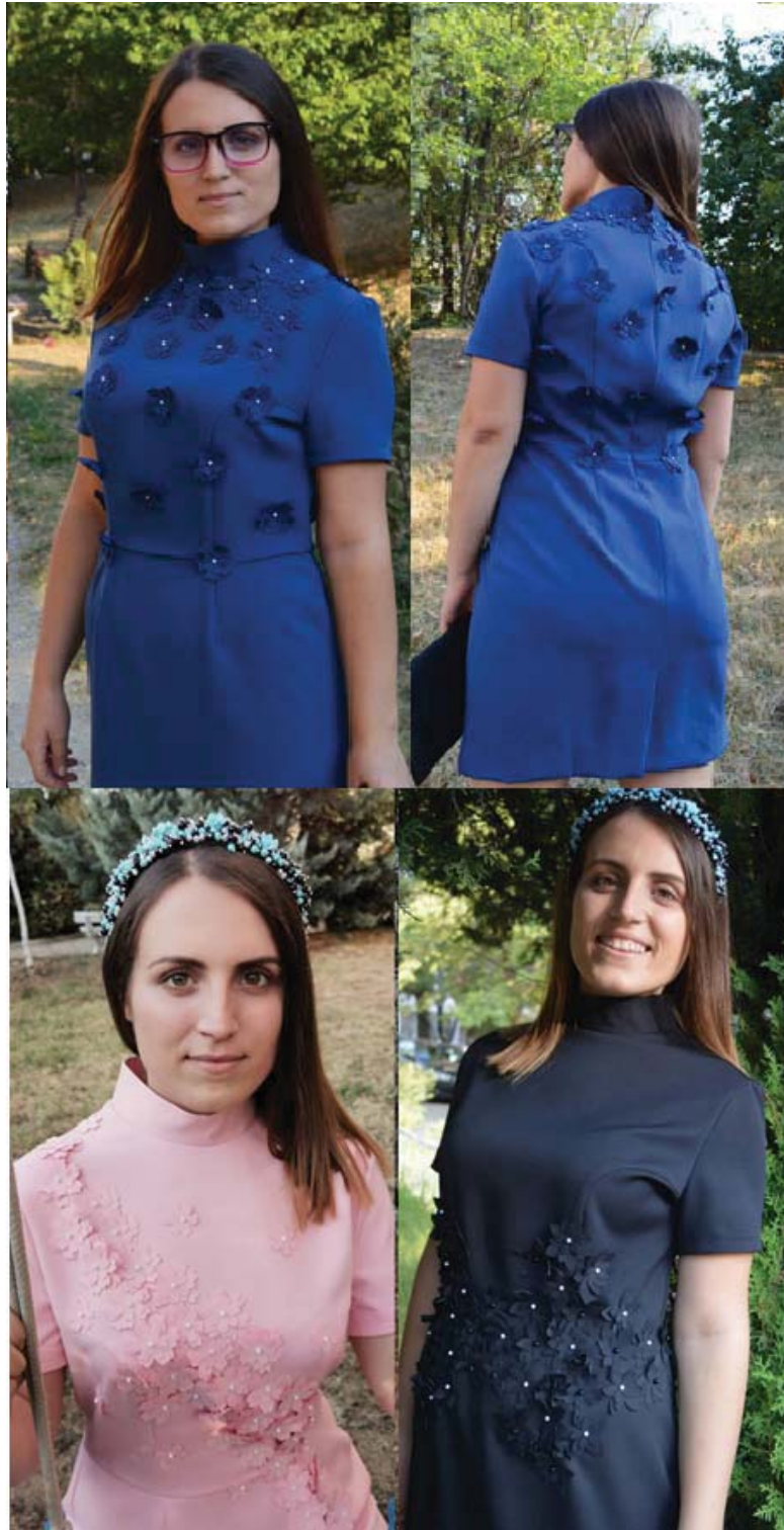
Fig. 4. Finished dresses with decoration elements cut from the fabric waste.