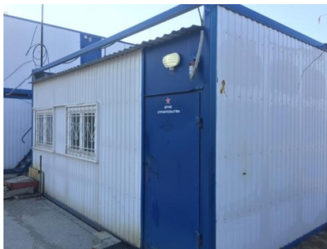
Fig. 2. Lighting above the entrance controlled by a motion sensor

"Smart home" means not only turning on and off certain devices under certain conditions, but also automatic control of the operation of lighting, ventilation, access, video surveillance, heating, fire alarm systems, etc. Alternatively stated, the "smart home" ensures the performance of routine control and management functions that take up a lot of time during the everyday operation of a residential building. The living environment becomes more comfortable and economical, which makes it consistent with the requirements of sustainable development.