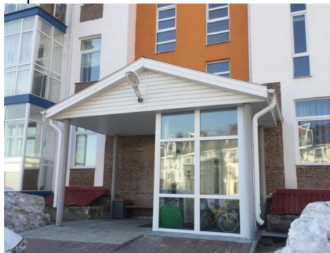
Fig. 1. Entrance group to an apartment building with the lighting controlled by a photo relay

Photo relays, motion sensors (Fig. 1, 2) are often associated with a "smart home". They are used to turn on the lighting when the illumination level drops below the permissible level or at movement detecting in the area of the sensor. Similar devices for remote control of individual devices are available from many electronics manufacturers. Control signal transmission devices are quite simple, their installation does not require the involvement of highly qualified specialists. However, they cannot be called a "smart home" in the full sense of the word. These are just separate elements of the system, usually not connected, and sometimes even incompatible with each other.