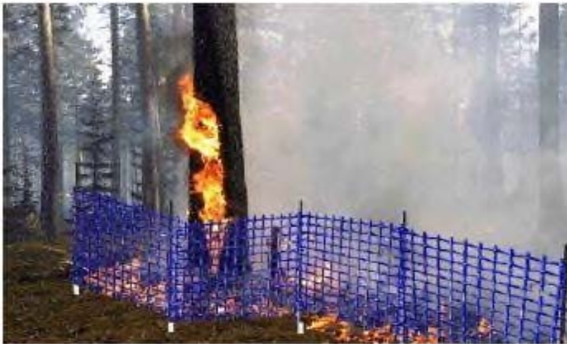
Fig. 4. Tests of electrical fire protection mesh

Moreover, the proposed integration of the tasks performed by the airship's crew and its technological capabilities make it possible to protect against the spread of fires in the steppes and forests by installing "electric protective strips" instead of mineralized ones. Domestic studies of the effect of electric and acoustic fields on the processes of combustion and extinguishing fires dating back to the end of the last century have shown their high efficiency. In particular, it was found that high-voltage pulsed electric fields emitted by a metal mesh (Fig. 4) block the spread of fire much more efficiently than mineralized strips, and also do not require equipment for embankment [16].