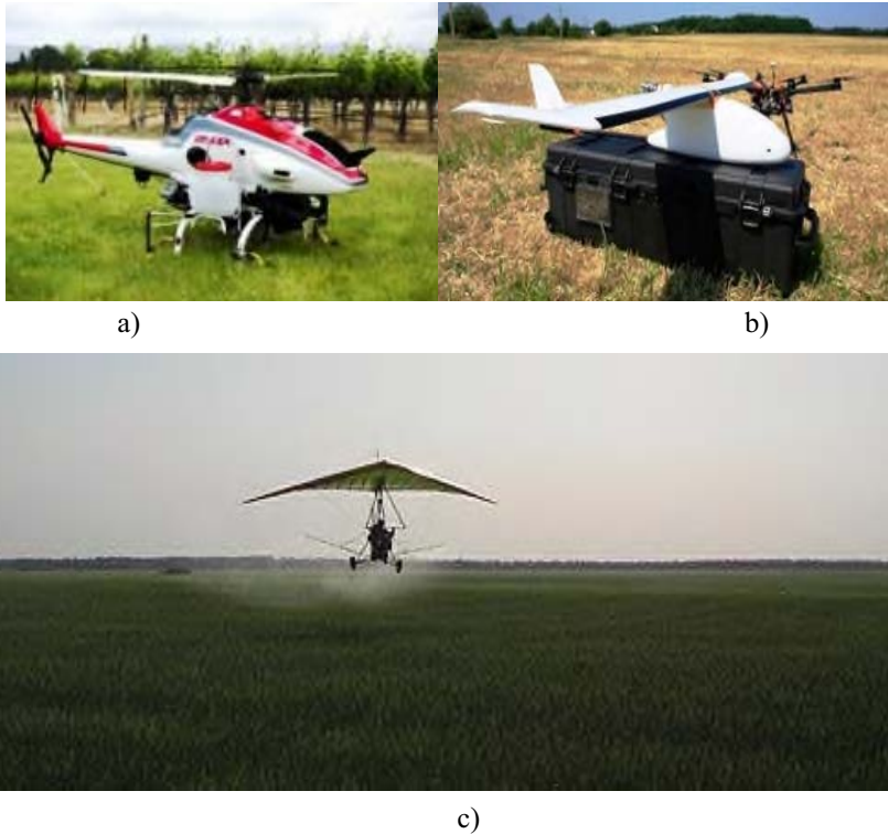
Fig. 1. UAVs ("a" and "b") and motor hang-glider ("c"), Source: http://www.aviaspekt.ru/

Monitoring with the help of UAVs of farmland and forest areas can economically solve the problems of early detection of fires, the main causes of which are the type of dominant vegetation, climatic conditions and the "human factor" [4-5].