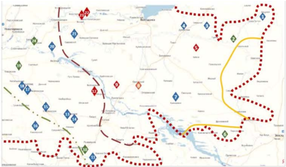
Fig. 2. Mapping of the studied water bodies and their ranking according to suitability for commercial fish farming