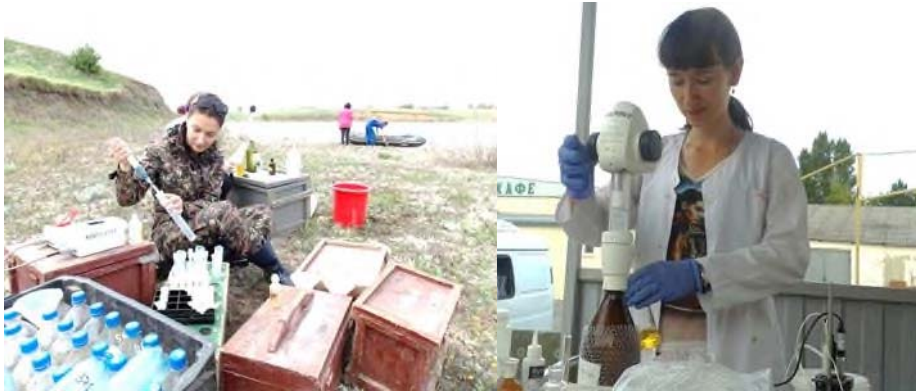
Fig. 1. Carrying out hydrochemical studies in the field

The hydrochemical analysis of water samples included the determination of dissolved oxygen, water pH, concentration of nitrate nitrogen, nitrite nitrogen, ammonium nitrogen, phosphates (for phosphorus), silicic acid, BOD 5 , total mineralization of water, total iron [12]. The assessment of the concentration level of indicators was carried out in accordance with the MPC for fishery waterbodies (MPC f ), established by Ministry of Agriculture of the Russian Federation. Hydrochemical studies conducted in the field are presented in Figure 1.