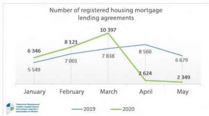
Fig. 1. Number of registered housing mortgage lending agreements [Rosreestr official website]

At first glance, all economic activity has stopped, however, many experts note that the demand for housing purchases rose sharply before the introduction of self-isolation measures for the population, and many transactions were concluded in an emergency mode. The reason for this behavior was the fear of the danger of being infected in the process of searching for suitable properties and the introduction of quarantine, as well as the fall of the national currency during this period.