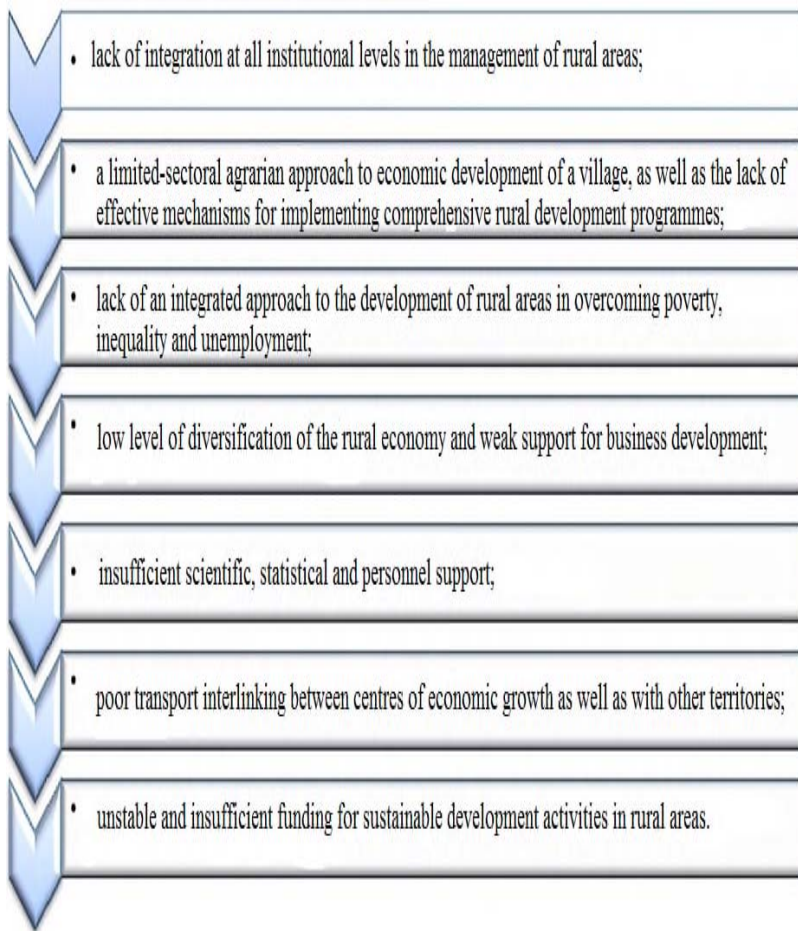
Fig. 3. Main factors hindering development of rural areas

Having analyzed the results of the programs, we can identify the main factors that slow down the development of rural areas (see Fig. 3):