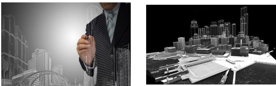
Fig. 3. Techniques and ways of forming a virtual architectural space.

The concept of virtual representation of an artistic image is based on the idea of virtual splitting up of available space through certain representations of shapes. Shapes can be permanent or temporary. They are to be identified by human consciousness and serve as boundaries between the physical and virtual environment (Figure 3).