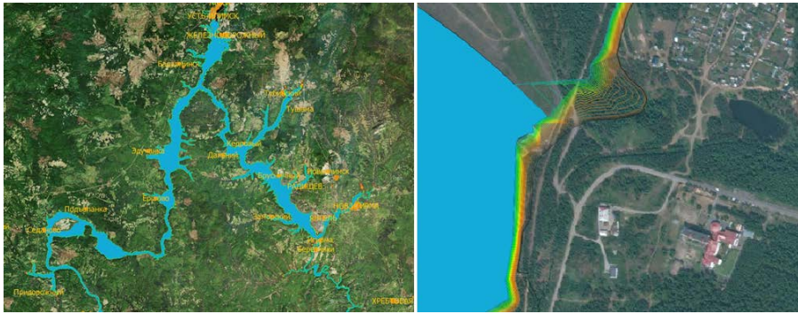
Fig. 4. The Ust-Ilimsk Reservoir and the fragment of the Ust-Ilimsk town.

In conditions of elevated and extremely high influx to Lake Baikal, taking into account the current rules for regulating water levels in the lake, there are high risks of flooding in the downstream of Irkutsk HPS. To assess the possible damage, we have developed a technique for modelling the channel of the Angara River as well as special software components that allow us to investigate flooding zones at various discharges through HPS.