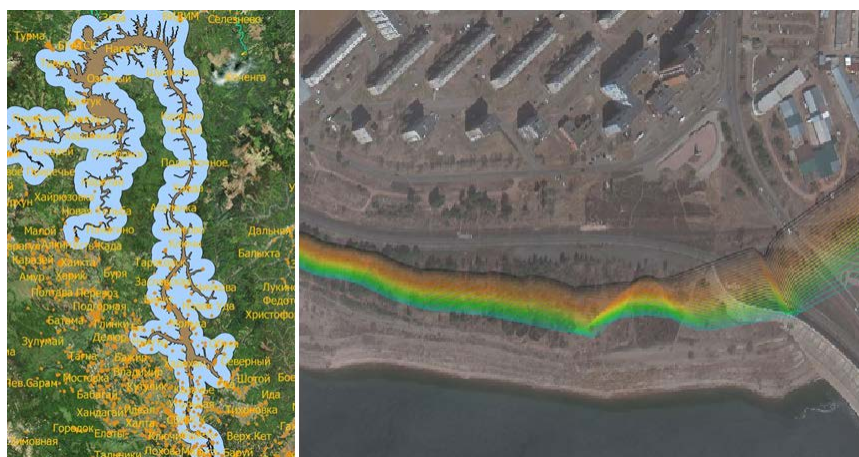
Fig. 3. The Bratsk Reservoir and a fragment of the Bratsk city.

Based on the technique described above, we developed digital elevation models of the Irkutsk, Bratsk and Ust-Ilimsk reservoirs (Figs 2-4), including the zones of possible flooding (in the form of contour lines) under various scenarios of the water content. Based on this technique, we generated an electronic map of the coastline (buffer zone from 4 to 10 km) and obtained a digital album for the Angara River within the Irkutsk Region. We processed 103 settlements within the Irkutsk Region and constructed contour lines with flooding threat levels for each of them.