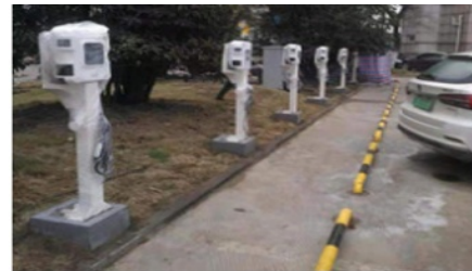
Fig5. Yongqing AC charging pile in Bengbu, Anhui

The proportion of allocation shall be clearly defined. The planning and land administration departments shall specify the charging pile configuration requirements for new public construction projects, residential communities and social public parking lots in the land transfer conditions.