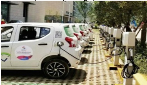
Fig7. Charging pile layout should be early, fast and reasonable

New public parking lots, office buildings, shopping malls, hotels and other public construction projects should be set with charging piles, which should not be less than 20% of the total planned parking space.