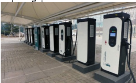
Fig9. Reasonably advanced construction, accompanied by vehicle piles, intelligently and efficiently optimized construction layout of EV charging facilities

The proportion of Party and government organs, institutions, enterprises and institutions that meet the requirements shall not be less than 10% of the total number of parking spaces.