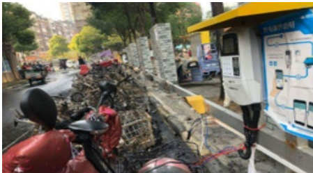
Fig8. Public charging pile at the north side of Building 10, Jinding Huangzhuang Phase II, Huangzhuang Street, Bangshan District, Bengbu City

The proportion of charging pile construction shall not be less than 5% of the planned total parking space when the old residential area is renovated.