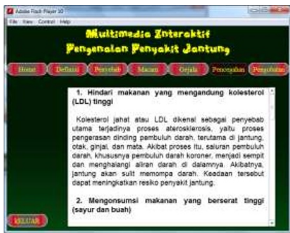
Fig. 8. Prevention menu page view.

The heart disease prevention menu page is the seventh scene that users will encounter when running this application. In this scene contains various menus contained in the application. Here's a look at the menu page. The way of prevention of heart disease is taken from reference 8.