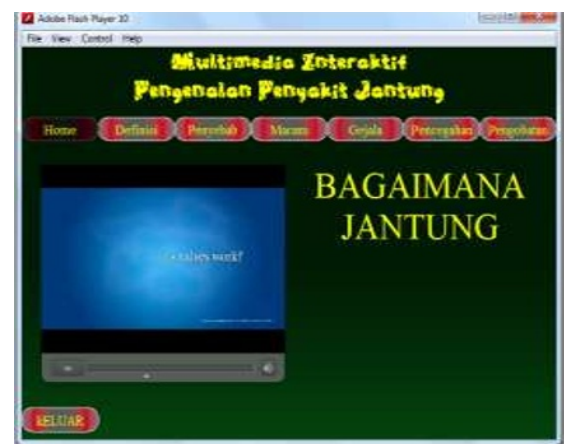
Fig. 2. Main menu page view.

The main menu page is the first scene that the user will encounter when entering the app. This main menu contains the home menu, definition, cause, variety, symptoms, prevention, treatment and exit of the system. The following is a view of the main menu page of cardiovascular detection using interactive multimedia with the Rich Internet Application. The main menu page of cardiovascular disease is taken from the reference 9.