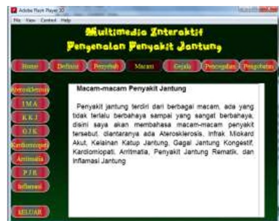
Fig. 6. Sort menu page view.

In the scene of various heart diseases it contains various sub menus contained in the application. The menu page of various heart disease is the fifth scene that users will encounter when running this application consisting of eight sub menus including: atherosclerosis, IMA, KJJ, GKJ, cardiomyopathy, aritmia, PJR, Inflammation. The following is a view of the menu page of various heart diseases from cardiovascular detection using interactive multimedia with rich internet application method. Various diseases are taken from references 4.