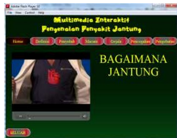
Fig. 3. Home menu page view.

The home menu page is the second scene that the user will encounter when entering this application. Here's a look at the page. This menu contains an explanation of how cardiovascular disease works in the human body 4 .