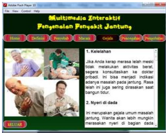
Fig. 7. Symptoms menu page view.