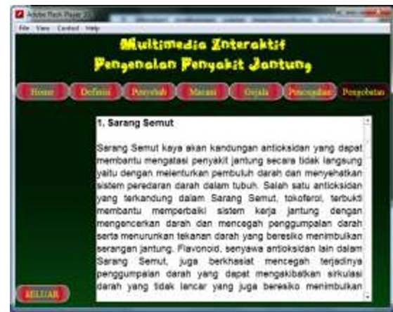
Fig. 9. Treatment menu page view.

The cardiovascular disease treatment menu page is the eighth scene that users will encounter when running this application. In this scene contains various menus contained in the application. Here's a look at the menu page. The treatment of cardiovascular disease is taken from reference 8.