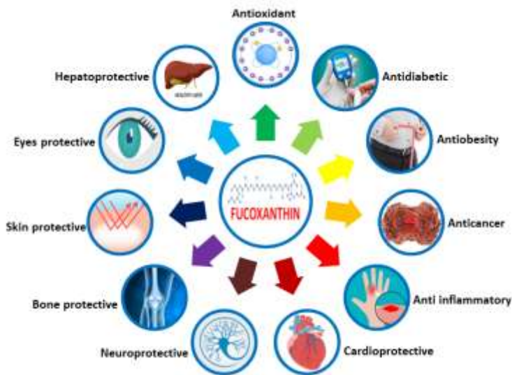
Fig. 2. The biological activities of fucoxanthin for human health

Fucoxanthin is a xanthophyll exhibiting several health benefits. This compound has remarkable biological properties for human health [109], such as anti-inflammatory activity [108-115], hepatoprotective effect [12,98,116-118], cardioprotective activity [119-121], anticancer [26,116,119,122-131], antidiabetic [75,132-134], antiobesity [135-139], antioxidant [65,131,140-146], skin protective effect [111,113,147-153], neuroprotective activity [75,155-161], osteoprotective effect [162,163], and eyes protective effect [164-166]. The biological activities of fucoxanthin for human health are shown in Fig. 2.