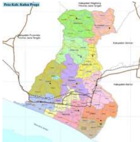
Fig. 1. Kulonprogo district

During 2015 in Kulonprogo Regency, the average rainfall per month was 164 mm and rainy days were 8 days per month. The highest average rainfall occurred in December 2015 amounted to 394 mm with a number of rainy days 17 days per month. Districts that have the highest average rainfall per month in 2015 are in Kalibawang District of 220 mm with 8 days of rainy days per month. Raw water sources in Kulonprogo Regency include 7 (seven) springs, Sermo Reservoir, and Progo River. The springs that have been managed by the PDAM include the Clereng, Mudal, Grembul, Upas Cave, and Progo River springs. In Kokap Subdistrict, springs are managed in a self-managed manner by the Subdistrict and Village, which are then channeled gravity by piping systems. Kulonprogo Regency, which is located between Menoreh Hill and the Indian Ocean, is crossed by the Progo River in the east and Bogowonto River and Glagah River in the west and center. The existence of a river with water that flows throughout the year in the Kulonprogo Regency area helps in maintaining the surface water conditions. The existence of the Sermo Reservoir in the Kokap Subdistrict is supported by the existence of an irrigation network that spreads almost in all sub-districts, demonstrating the seriousness of the Kulonprogo Regency Government to increase agricultural and fisheries production in the Kulonprogo Regency area.