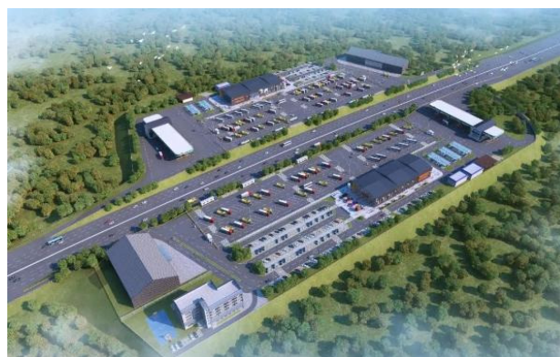
Figure 2. Sketch of freight theme service area in Guangdong Province

Logistics enterprises around the logistics park are attracted in the service area. And then realize the industrial agglomeration effect of the logistics enterprises centered on the service area. Meanwhile, the service area can process and sell agricultural products in surrounding villages and towns. The service area can be used as a basic exhibition platform for information release, which provides the information about the market demand and supply to the surrounding area. Such service area also should establish logistics information data platform for the passing vehicles. The service area can provide storage, distribution, turnover, distribution and other basic information for logistics companies around the service area. The first freight theme expressway service area starts construction in Guangdong Province [10].