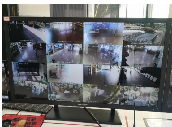
(a) Intelligent supervision

The smart service area can provide a better service experience for passing drivers and passengers. Through big data, online tracking and mining analysis of people flow, traffic flow, logistics turnover, behavior habits, consumption preferences, etc. The service area can actively recommend the available service resource information in front of the driving vehicle, and realize the intelligent guidance of the vehicles. The dynamic adjustment of service resources realized through big data analysis. With the help of big data, the service area can not only provide the public with accurate services in the service area resources before and during travel, but also alleviate service area and road congestion. Thereby, the service area can provide better quality and more humanized travel services for passing vehicles and personnel.