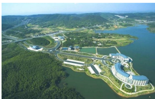
Figure 1. Landscape of service area in Jiangsu Province

This kind of service area is generally the integration of the rich tourism resources around or along the road [6], based on traditional functions, and combined with the service area to create a "service area + tourism". The size of service area, building size, geographical features, resource endowments, and peripheral industries are not the same. The factors mentioned above determine the differences in the service area. The geographic locations where the service area, natural resources have become the core area of service differentiation. Therefore, the basic functions of the existing service area can be optimized, and the service image, brand influence, operating ability, and cultural marketing can be improved. The service area should be re-planned. Regions such as supermarkets, stores and toilets are strictly divided. And tourist parks are built in idle areas. At the same time, large service areas with huge areas and connected to the outside world are built into ecological parks or forest parks and other distinctive service areas.