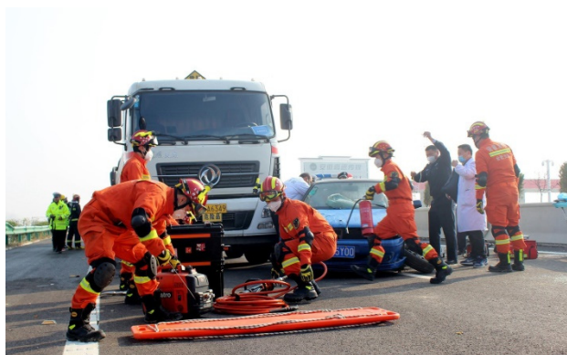
Figure 3. Traffic accident emergency drilling of service area in Anhui Province[11]