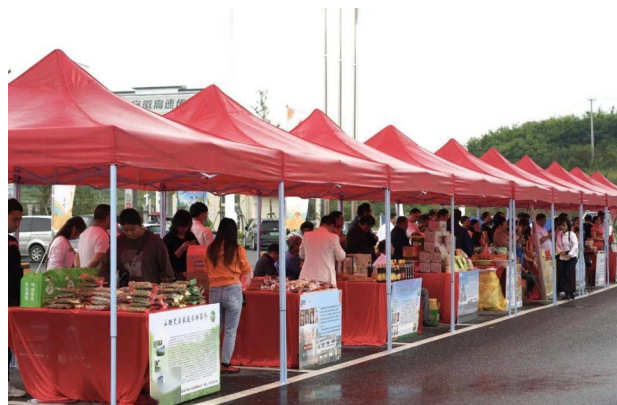
Figure 4. Agricultural products counter for poverty alleviation in service area in Anhui Province