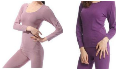
Figure 1 Fit of traditional underwear

The knitted underwear fabric developed based on avocado fiber features skin moisturizing, so the product should fit the skin as much as possible to give full play to the fabric's moisturizing effect. Female body curves are mainly shown in their breast, waist and hips and the undulation of muscles. Traditional knitted underwear rarely has split lines, so it is quite loose and fails to fit the