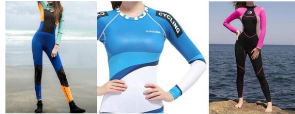
Figure 2 Ideal fit of functional underwear

body well, especially under the breast and arms, and at wrists and legs (see Figure 1). Skintight sportswear usually fits the body ideally (see Figure 2). The fitness of knitted underwear developed based on the moisture retention of avocado fiber should lie somewhere between traditional knitted underwear and skintight sportswear, so that it can serve better moisture retention and skincare.