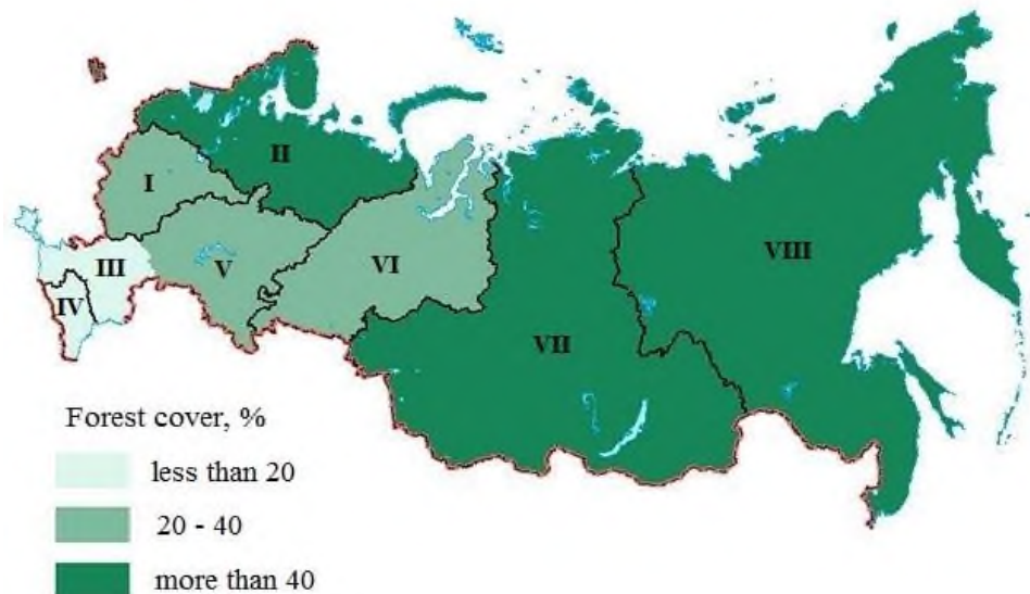
Fig. 1. Forest cover of the territory of the Russian Federation in the context of federal districts: I – Central; II – Northwestern; III – Southern; IV – North Caucasian; V – Volga; VI – Ural; VII – Siberian; VIII – Far Eastern

The Russian Federation is the world leader in forest area – 1184.1 million hectares, or 20 % of the total forest area of the world. One of the main features of the forests geography is their uneven territorial distribution. For 2019, the forest cover of the Russian Federation federal districts is shown in Figure 1.