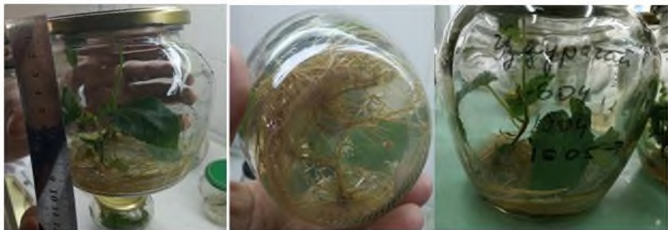
Fig. 2. Micro-propagated seedlings of Jararik-9 variety and hybrid mulberries of Uzbekistan by in vitro method

the Uzbek hybrid was prepared with the addition of all components and vitamins of Murasige Skuga (MS). After sterilization, the branches are first transferred to a nutrient medium without phytohormones. When sterilizing agents were used in different amounts, a 0.01% solution of silver nitrate and 5% sodium hypochlorite gave good and soft sterilizing results. We were also able to determine the nutrient medium and conditions that allow the sterilized plant parts to grow in vitro. At the same time it was possible to select the optimal conditions for rooting of selected mulberry varieties and hybrids, the emergence of joints, the development of the leaf blade. Growing conditions in the experiments: photo cycle - 16/8 hours night - day, illumination 4000-6000 lux, room temperature 24-26 0 C, relative humidity 60-70%. In our study, the Uzbek hybrid and the Jararik-9 variety were better adapted to the artificial nutrient medium than the Balkhi mulberry and 'Shotut' mulberry variety. In our research on the selection of nutrient media for artificial propagation, determination of phytohormone concentrations and cultivation of seedlings in vitro, the first results were obtained by in vitro micropropagation of selected varieties Jararik-9 and hybrid mulberries of Uzbekistan (Figure 2).