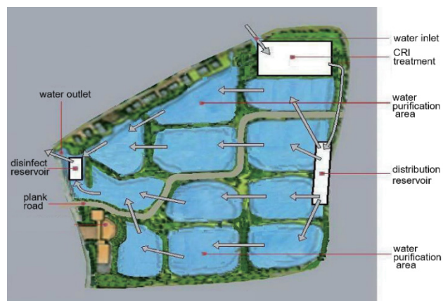
Fig. 2. Plan of sewage treatment system.

for wastewater treatment requires better engineering design, thus more accurate pollutant removal models are needed. The sewage treatment system of the park is designed based on the above parameters (Fig.2; Fig.3). As an effective tool to control non-point source pollution, constructed wetlands is a new disposal method which is efficient, economical and environmental protection, are increasingly recognized in Dianchi Lake area.