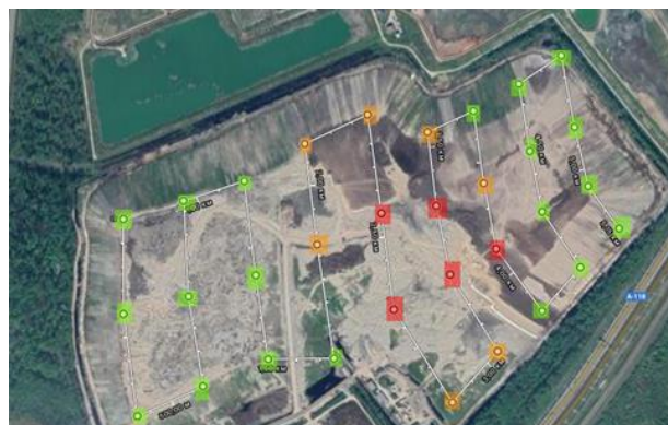
Fig. 3. Model of the route of an unmanned aerial vehicle with key points.

The map shows the object of the study-the Novoselki landfill, located on the territory of St. Petersburg. The route of an unmanned aerial vehicle was modelled for the territory of the landfill. The route of the unmanned aerial vehicle was modelled for the landfill area. After testing the prototype of the improved mobile monitoring system, we will be able to create a map of the area that reflects the level of radiation at each of these points. Figure 3 shows model of the route of an unmanned aerial vehicle with key points.