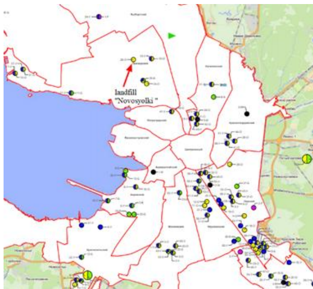
Fig. 2. Environmental map of St. Petersburg.

Of interest is the possibility of new radiation monitoring system earlier than the old radiation monitoring system warning of state bodies, the public and the population of St. Petersburg about the beginning of a radiation accident at a radiation-hazardous facility, which will allow taking adequate measures to protect the population and the environment from the damaging effects of radiation exposure. Figure 2 shows environmental map of St. Petersburg and the details of the location of the research object - the existing landfill.