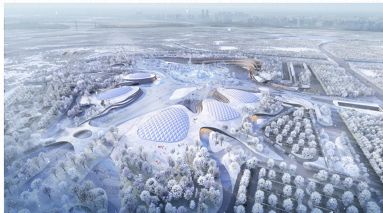
Figure 1. Architectural renderings.

The total land area of the project is about 87 hectares, and the total construction area is 96,000 square meters. The main functions are composed of outdoor parks and indoor venues. The outdoor park is composed of ice construction and ice sculpture exhibition area, ice slide area, ice rink recreation area, non-powered recreation area, ferris wheel and other functions. Indoor venues include: Iceberg Pavilion, Dream Ice and Snow Pavilion, Ice and Snow Show, Ice and Snow Art Museum, Comprehensive Museum, Ticket Office at the main and secondary entrances as well as related supporting facilities. This paper analyzes the basic form and layout of the ice and snow show.