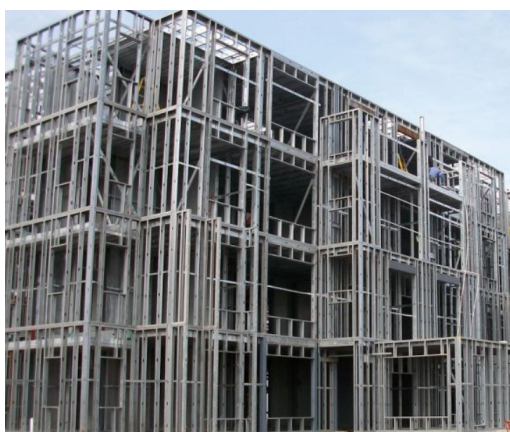
Fig. 1. Cold-formed thin-walled steel structure residence

Compared with ordinary hot-rolled section steel, the processing of cold-formed thin-walled steel is more simple, fast and efficient, so it is widely used in villas, multi-storey residential buildings and light steel plants [1] , as shown in Fig.1. The steel can be completely recycled to meet the requirements of environmental protection and sustainable development.