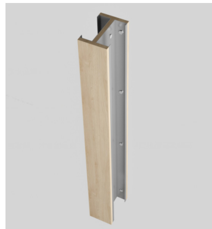
Fig. 3. Cold-formed thin-walled steel-timber composite column

At present, the widely used cold-formed thin-walled steel housing structure system is a "box" structure [7] , which is composed of composite wallboard, floor and roof truss. The horizontal load of this structure is borne by the shear wall, and the vertical load is borne by the columns in the bearing wall. The "box" type cold-formed thin-walled steel housing structure system is a non frame structure with relatively low bearing capacity, and the section type of bearing members is too single to meet the use requirements of multi-storey and high-rise buildings. In order to improve the bearing capacity and seismic performance of cold-formed thin-walled steel frame structure, the beam column with steel wood composite section is used as the main load-bearing member, and the board is used to restrain the overall instability and local buckling of cold-formed thin-walled steel. The cold-formed thin-walled steel-timber composite section member is assembled by cold-formed thin-walled steel members by adding wood plates and adopting bolt connection, as shown in Fig.3.