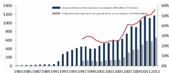
Fig 2. China's actual utilization of foreign investment

In recent years, the growth of direct investment attracted by China's service industry has been relatively stable, and China's service industry has formed a relatively open pattern. Foreign investment in finance and insurance, transportation, communications, tourism, retail, catering, advertising, professional consulting, education, healthcare, and trade, Computer and related services, construction, real estate and other service sectors are playing an active role. The industry in which multinational service companies are located has gradually diversified from the initial tourism facilities, real estate, and accommodation and catering industries.