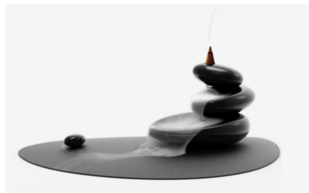
Fig 1. "high mountains and flowing water"fragrant plug.

National Grand Theater, which perfectly embodies the integration of Oriental culture and modern design.