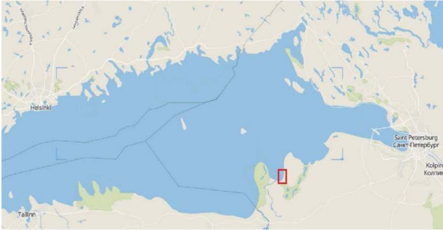
Fig. 1. General view of seaport Ust-Luga's location on the Gulf of Finland's map (red rectangle).