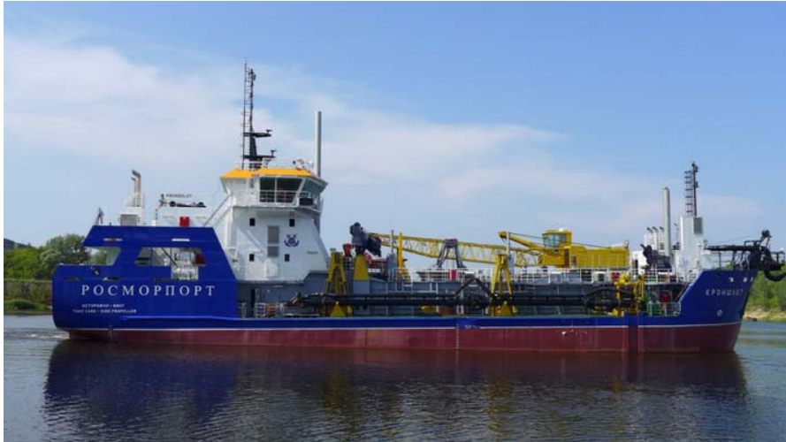
Fig. 7. Dredging vessel Kronshlot built in 2016.

We also established that dredging in the southern part of the seaport of Ust-Luga is expected to be carried out until the end of 2020, so increased turbidity in the Luga Bay will be observed further, until the end of these works. Note, discussion of the environmental consequences of the above-mentioned dredging operations in seaport of Ust-Luga is not task of this article.