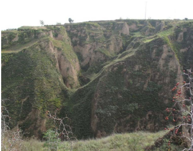
Fig. 6. Site of loessial array of the pseudo-karst complicated by the development to the condition of a bedland (the Province of Gansu, China).

The passive option supposes, that actions are carried out after phenomenon of the loessial pseudo-karst on the land surface in the form of sinkholes, funnels, wells, etc. The causes of emptiness are removed. Ditches, other meliorative actions for the elimination of forming of the concentrated water flows are projected on the mountain slopes. Filling of the pseudo-solution cavities, found as the result of geophysical surveys and the subsequent drilling, with the condensed soil or concrete mix is made.