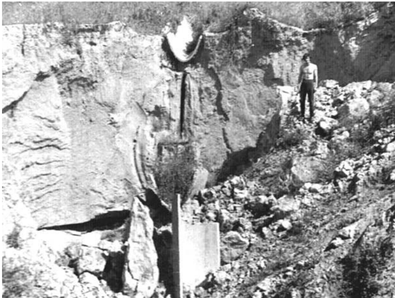
Fig. 2. As the result of water leak the pseudo-karst ravine within 1 day was created from tray network. Javanese valley, Tajikistan. Photo by A.A. Lavrusevich, 1987.

The extensive complex of abiotic, biotic and technogenic factors is necessary for the formation and development of the loessial pseudo-karst (geomorphological, climatic, soil, lithologic, biological, etc.). The loessial pseudo-karst develops if there are loessial breeds with power not less than 3-5 m, with rather high porosity, low humidity, with the low maintenance of carbonates and also a possibility of incidental penetration of water into a loessial array. A source of water includes atmospheric precipitation (a climatic factor), leak of water from hydraulic structures, not dosed watering of fields, etc. (technogenic) [5]. The question of a role of organisms in the course of forming of a loessial pseudo-karst was already brought up in literature [5.15, etc.]. It was specified that in development of a loessial pseudo-karst activity of vertebral, higher plants, blue-green, green and other seaweed is of great importance.