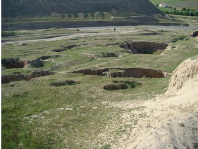
Fig. 5. Suffosion (pseudo-karst funnels and sinkholes) on the surface of the proluvial terrace (the left bank of the Surkhandarya River) [14].