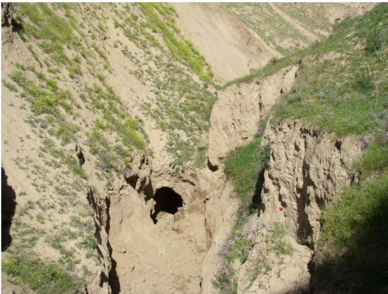
Fig. 3. Type of a pseudo-karst cavity in the thickness of the proluvial loess (the valley of the Surkhandarya River) [14].

At development of a loessial pseudo-karst a peculiar pseudo-karst landscape (funnels, or chains of funnels, water-absorbing ponor) wells, tunnels, caves, circuses, ravines, etc.) is formed very reminding typical karst (fig. 3). Quite often, in places of active development of pseudo-karst and defeat of a loessial array there are residual forms of a relief: walls, columns, etc. Classification of pseudo-karst forms is offered by N.I. Krieger [3], later it is expanded and added [5 11, etc.].