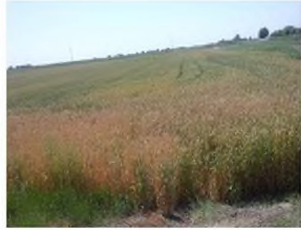
Outbreaks appear to be exacerbated during fusarium wilt