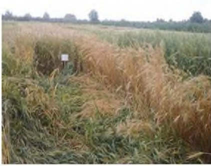
Wheat field infected with fusarium wilt