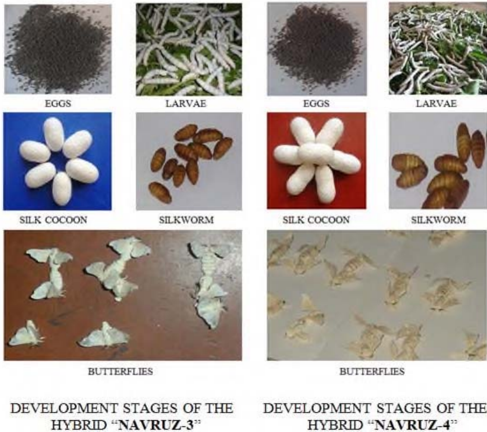
Fig. 2. Development stages of the hybrid silkworms.

As can be seen from Table 2, the test hybrids lag behind the zoned Ipakchi-1 x Ipakchi-2, Ipakchi-2 x Ipakchi-1 in terms of dry cocoon weight and length of unbroken cocoon fiber. It follows that the hybridization of breeds with inbred systems leads to an increase in the technological performance of mulberry silkworm cocoon fiber. The obtained new hybrids were tested and regionalized in production F-3x (L-51x Kit 108) (Navruz-3), (L-51xYaP 66) x F-4 (Navruz-4). Photos of the hybrids by development periods are given below (Fig. 2).