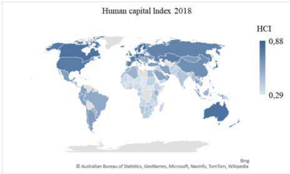
Fig. 1. Ranking of countries by the HCI on the world map, 2018.

While the HCI provides insight into the benefits of different countries in terms of human capital development, it does not always reflect the degree to which human capital is linked to economic growth. Nevertheless, the existence of this relationship was established in the works of P. Romer, devoted to the model of endogenous growth [16]. The literature notes that the differences between countries in terms of GDP by 10-30% are caused by differences in the development of human capital [17]. The influence of human capital on economic growth is explained by the fact [18] that it contributes to the creation and dissemination of new products and technologies. In addition, the owners of “high” quality human capital are capable of more complex work, and the latter creates more added value per unit of time than the work of an unskilled worker.