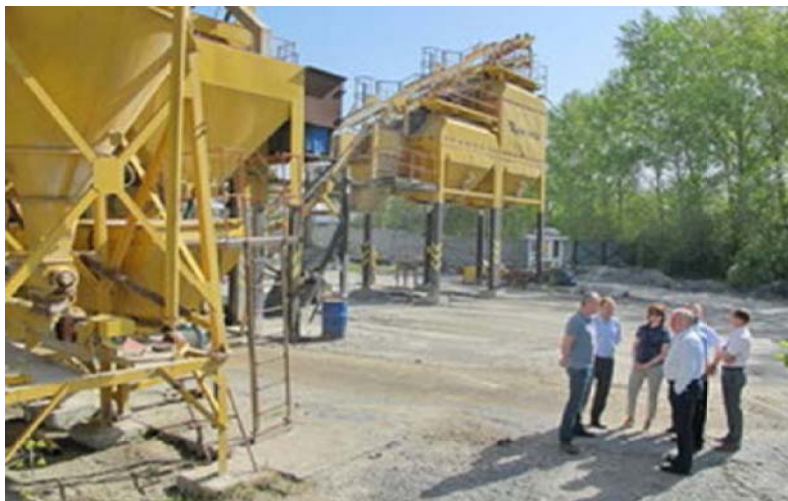
Fig. 1. Location of the plant in the city; type of work site.

In our work, we decided to make sure of the hazard class of the plant at the moment, because we are seeing an increase in production. The list of substances that make the greatest contribution to air pollution from the activities of this plant: alkanes C12-C19 (limit hydrocarbons C12-C19) - 18.306526 t / year; carbon monoxide-10.325145 t / year; inorganic dust: 70-20% SiO 2 -3.002978 t / year; nitrogen dioxide - 2.078346 t / year.