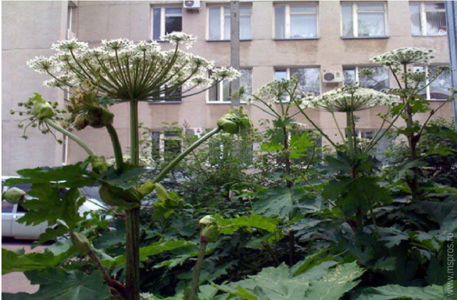
Fig. 1. Distribution of Heracleum Sosnowskyi in the area near residential buildings.

Currently, the problem of the spread of Heracleum Sosnowskyi has gone beyond the boundaries of agricultural lands. This aggressive plant began to spread intensively in settlements and in urban areas. In the cities, Heracleum Sosnowskyi began to populate undeveloped territories, by bringing seeds by the wind, with the wheels of cars, and birds. On playgrounds, lawns, he began to appear in connection with the delivery of soil contaminated with Heracleum Sosnowskyi seeds to these urban objects from other places. (Fig. 1). Therefore, the problem of the spread of an ecologically dangerous plant - the Heracleum Sosnowskyi in settlements has become quite acute, which must be addressed first of all.