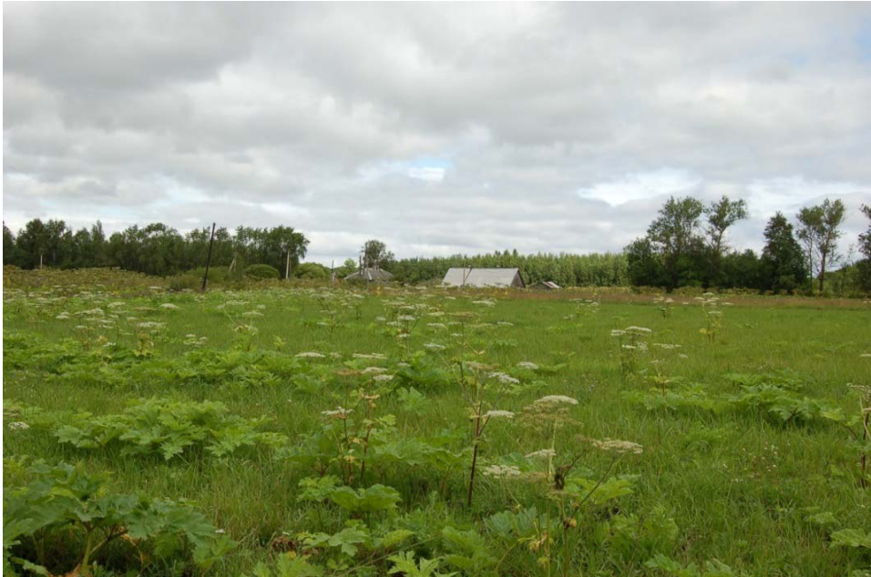
Fig. 2. Settlement of the meadow with Heracleum Sosnowskyi .

This requires monitoring of lands and subsequent mapping of the habitats of the Heracleum Sosnowskyi . Modern technologies of remote sensing of the earth (ERS) make it possible to carry out such effective monitoring and obtain information about the state of land resources without direct contact with the object under study. Specialized PC technology provides spectral analysis and registration of differences in reflected sunlight from the earth's surface covered by the studied plants in a state at different stages of their development. The brightness values are combined into certain channels that are informative for highlighting the object under study. They are used to calculate "spectral index" values. Based on these data, an image is constructed that corresponds to a certain value of the index in each pixel, which allows you to select the object under study and assess its state [3, 4]. In this regard, special field studies are required to obtain spectral characteristics of the physiological state of plants ( boletus Sosnowskyi ), which are obtained on the basis of the developed vegetation indicators [5]. Spectral characteristics of the physiological state of plants make it possible to determine the parameters necessary for weed control: phases of plant development