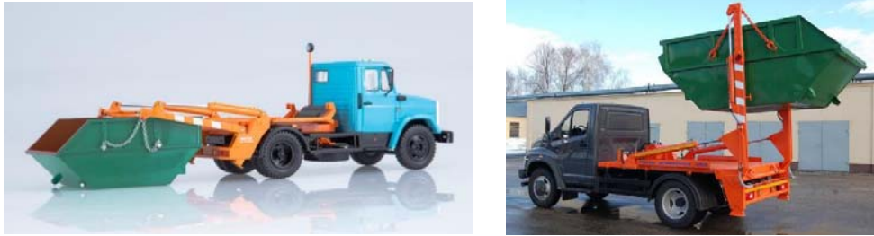
Fig. 2. Gantry hopper garbage-removal truck

garbage-removal truck platform there are special supports adjustable to different sizes of containers. The gantry arrows of a hopper truck may be both single- and two-section. In the latter case, a hopper truck may take its body off onto a surface above the bearing plane of the truck.