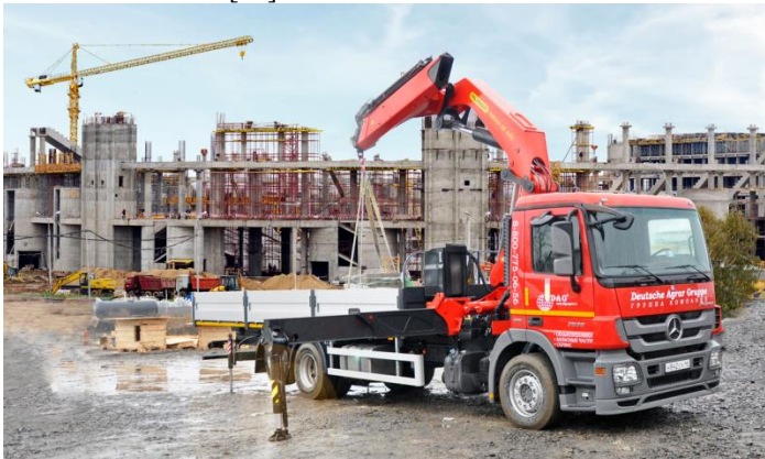
Fig. 4. A lorry with a crane manipulator at a construction site

A lorry with a crane manipulator replaces several types of equipment at once (fig. 4): it delivers cargos, unloads them and places where necessary, reducing the time and financial expenses during production of work. Today, it is more rational to move cargos weighting up to 30 tons with the help of a crane manipulator, more so as their price is several times lower than that of a motor crane [23].