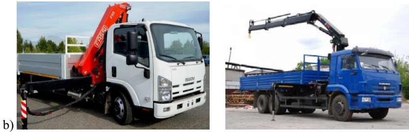
Fig. 3. A lorry with a crane manipulator: a - L-shaped crane manipulator; b – Z-shaped crane manipulator

A lorry with a crane manipulator replaces several types of equipment at once (fig. 4): it delivers cargos, unloads them and places where necessary, reducing the time and financial expenses during production of work. Today, it is more rational to move cargos weighting up to 30 tons with the help of a crane manipulator, more so as their price is several times lower than that of a motor crane [23].