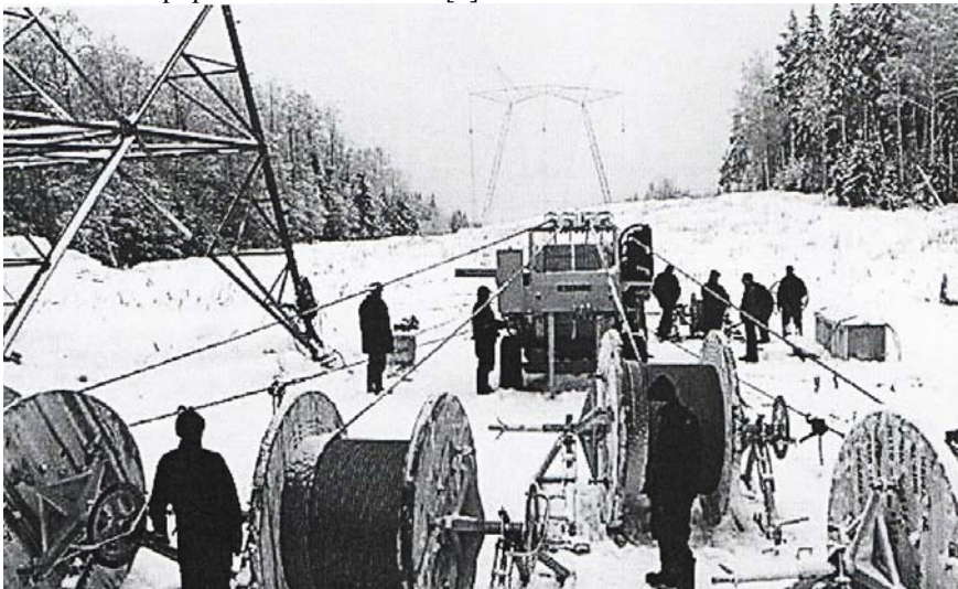
Fig. 3. Pulling of wires of overhead lines

Mobile formations are actively and successfully working in the basic industry of the Russian economy - the electric power industry (Fig. 3). For example, in the 80s of the twentieth century, the construction of a power transmission line 750kV became widespread. By this time, such voltage classes as 1150 kV AC and 1500 kV DC did not exist in the world. Therefore, the construction of transmission lines of such a high voltage opened up great prospects for our country, since it became possible to transfer electricity over thousands of kilometers with minimal losses. The goal was set to create a unified energy system of the Soviet Union from five subsystems of Siberia, Kazakhstan, Ural, Volga and Center. The Siberia - Kazakhstan - Ural branch was built and put into operation in stages. The Resolution No. 243 “On the creation of the Ekibastuz fuel and energy complex and the con-