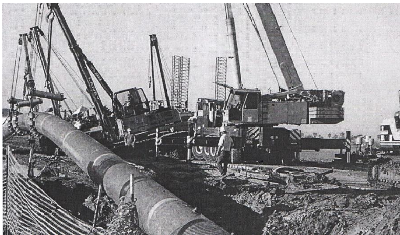
Fig. 2. Laying the main pipeline

Mobile formations for laying main pipelines are distinguished by extremely high mobility [5, 6]. Usually, for pipes with a diameter of up to 500 mm, low-alloy steel is used, and for large-diameter pipes of 1000-1420 mm, low-alloy steel grades are used with obligatory heat treatment for strengthening and rigidity. Such pipes are made with a length of 11.6 meters using seamless technology or with an electric welded seam. Various polymers and polyethylene are used for pipe insulation. Pipes are laid in trenches using specialized heavy equipment (Fig. 2).