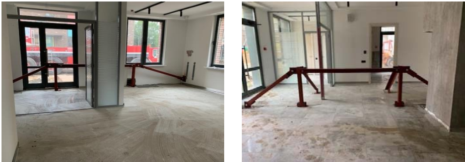
Fig. 5. Installed braces for additional dynamic loads absorption for large modules transportation and installation.

It was previously noted that the weight of an oversized module can reach a maximum of 80 tons. Due to the large dimensions of the transported modules and the large weight during transportation from the plant where they were manufactured to the construction site, it was necessary to conduct research and experiment. In preparation for the experiment on the transportation of modules, many different studies were carried out, one of which is the installation of a pre-calculated and designed brace to ensure the perception of additional dynamic loads during the transportation and installation of large-sized modules. Before the start of the transportation of modules, sensors were installed - beacons, which recorded various types of deformations during the transportation of modules. As a result of the experiment, the installed brace inside each transported module justified its need. Part of the loads fell on it, and the spatial rigidity of the transported module remained unchanged (Fig. 5 and Fig. 6). During the experiment, 10 vehicles with oversized cargo were transported at night. The experiment was carried out by the GC "MonArch" with the support of the Moscow City Government.