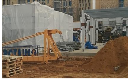
Fig.1. Building block modules erected in building conditions.

The technological sequence for the construction of large-scale residential buildings is as follows: