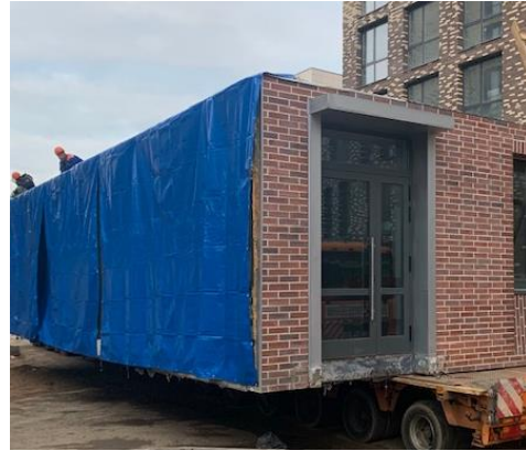
Fig. 6. Test transportation of oversized modules.