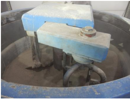
Fig. 1a Mixing of ingredients

The concrete mix was made in the Accredited Test Laboratory located at the Faculty of Civil Engineering at the Wrocław University of Technology. In the first stage all the components of the concrete mixture were mixed and then basalt fibers were added (figures 1a,1b). Then the ready mixture was placed in 100×100×500mm molds and stored until demoulding.