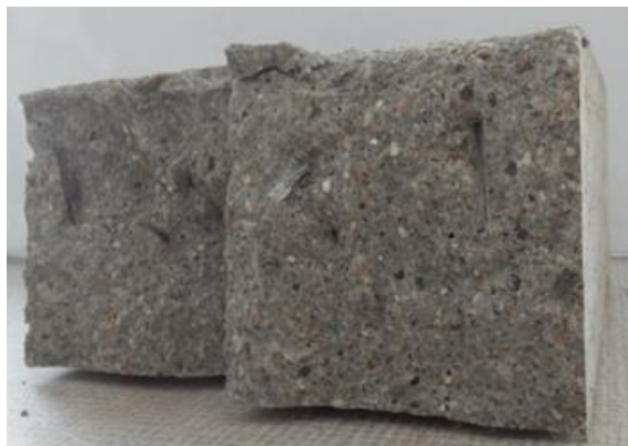
Fig. 4a Cross-section of the sample