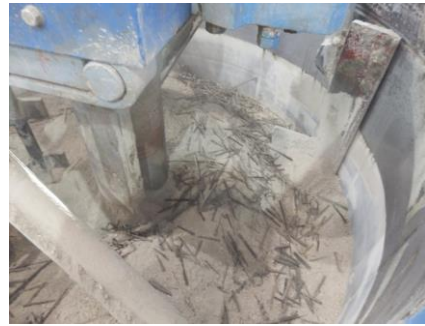
Fig. 1b Mixing of ingredients with basalt fibers

The sample shrinkage was tested on the basis of the PN-84: B-06714/23 standard. Determination of volumetric changes by the Amsler method. It consists the change in the length of the sample, determined with the Amsler apparatus, in relation to its initial length. The test was carried out on bars with dimensions of 100×100×500mm made by using aggregates with a grain size not greater than 16mm according to the recipe in tab 1.