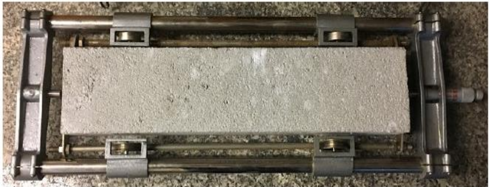
Fig. 2. Sample with measuring instrument

The sample shrinkage was tested on the basis of the PN-84: B-06714/23 standard. Determination of volumetric changes by the Amsler method. It consists the change in the length of the sample, determined with the Amsler apparatus, in relation to its initial length. The test was carried out on bars with dimensions of 100×100×500mm made by using aggregates with a grain size not greater than 16mm according to the recipe in tab 1.