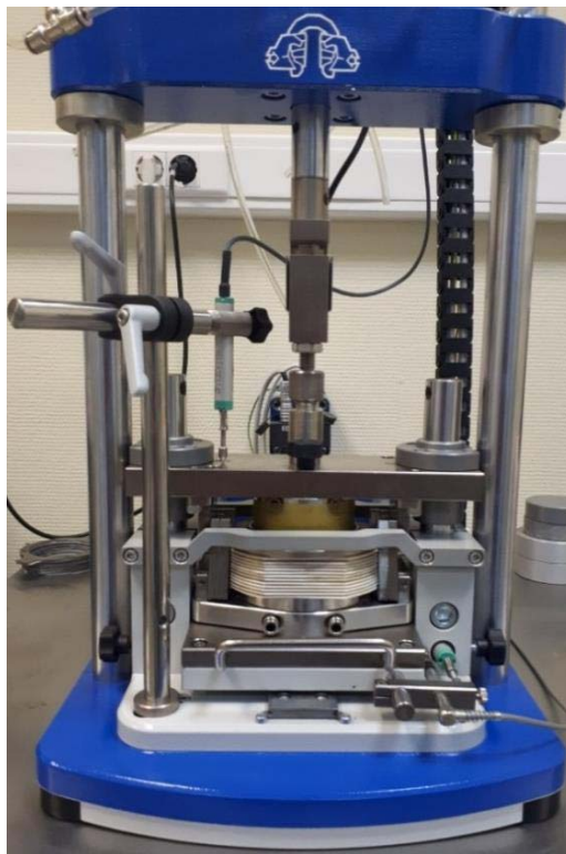
Figure 1. Simple shear device manufactured by «NPP Geotek».

To study the rheological properties of dispersed soils, laboratory tests were carried out on certified equipment manufactured by «NPP Geotek» (on a simple shear device), which includes a shear device for creating a horizontal load, a measuring system and software. The general view of the device on which the twin samples of dispersed soils were tested by the simple shear method is shown in Figure 1.