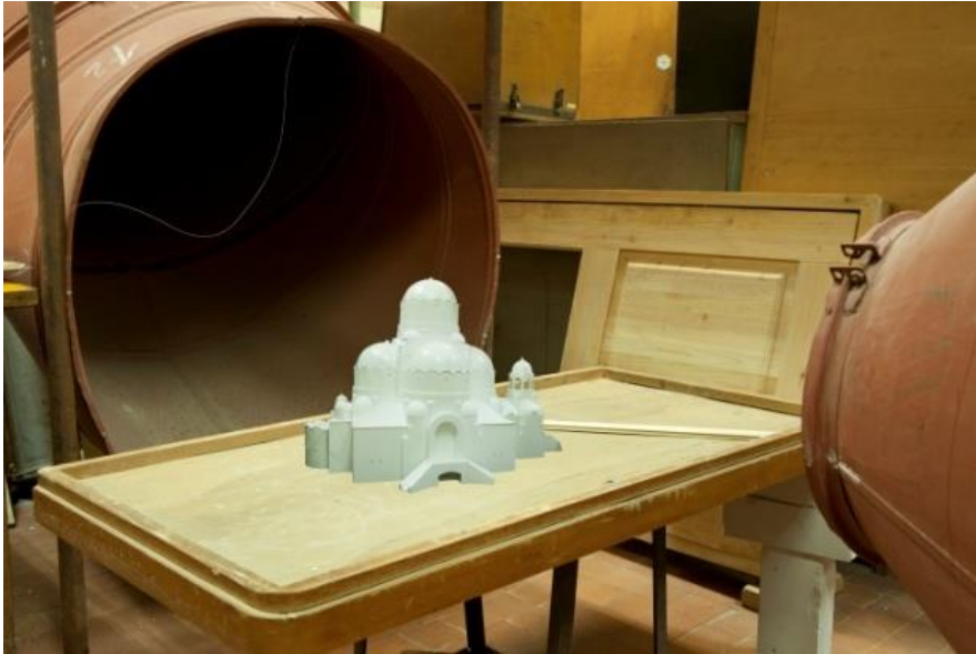
Fig. 3. The research of external aerodynamics on a physical model of real existing Cathedral.

The research in aerodynamics using physical modeling is a reliable way to get data about outer conditions influencing on natural and mechanical ventilation operation properties. It is very common to combine and add a data collected on the model to complex dataset of a research.