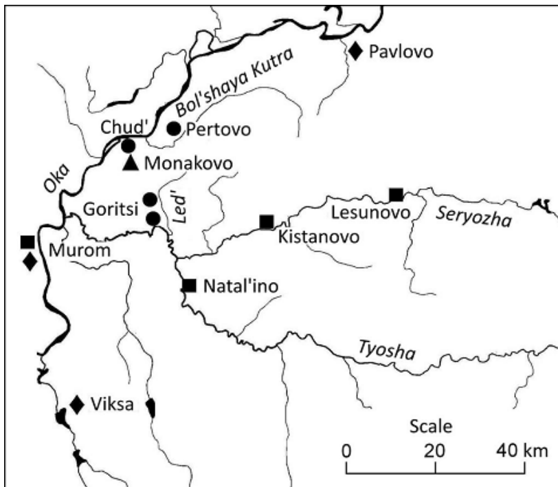
Fig. 1. Points of monitoring observations:

The meteorological station of the SIA Gidrotekhproekt was installed in the village of Monakovo at a distance about 2 km from the NPP site. The location of the meteorological site was chosen in compliance with the requirements of the national hydrometeorological service. When studying the climate of the NPP site vicinity area, data from the meteorological stations Murom, Pavlovo and Viksa were also used.